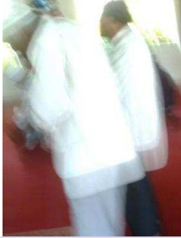
Brothers praying during Ramadhan