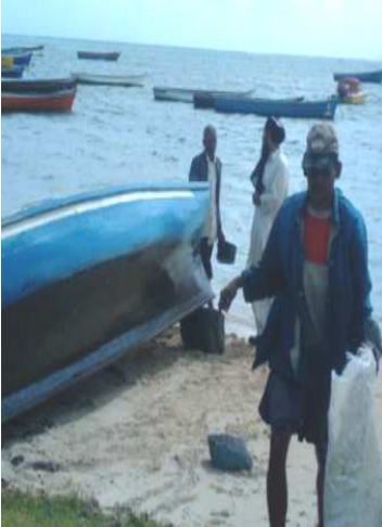
Dawah/Tabligh during Ramadhan