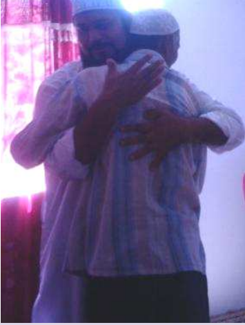
First Day of Ramadhan (Mussaffa with members)