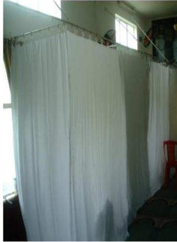
The Ittikaafi in their corner of the Mosque