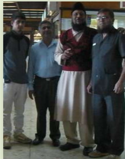
SOME SELECTED PHOTOS