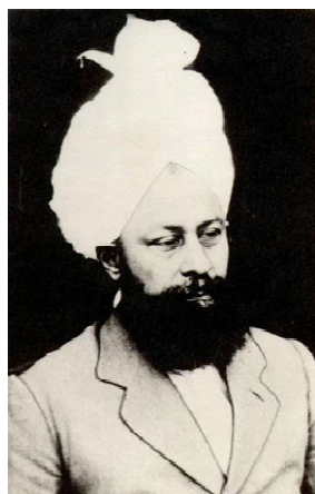
Hazrat Mirza Bashiruddin Mahmud Ahmad - Musleh Maoud (ra)

(Oh Allah) “I seek Thy pleasure all the time. If I am favoured with it, I shall feel that I got all that there is to get.”