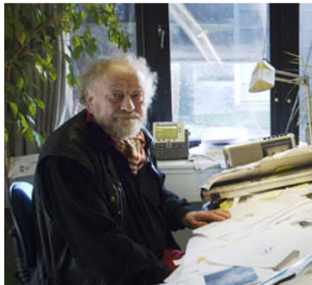
Kurt Westergaard – Danish Cartoonist who pictured the Holy Prophet having bombs on his head

The Khalifatullah (pbuh) reminded the Jamaat and all people that he already sent a warning in the aftermath of the first cartoons made on the Holy Prophet Muhammad (pbuh) in Denmark ( Jyllands-Posten ).